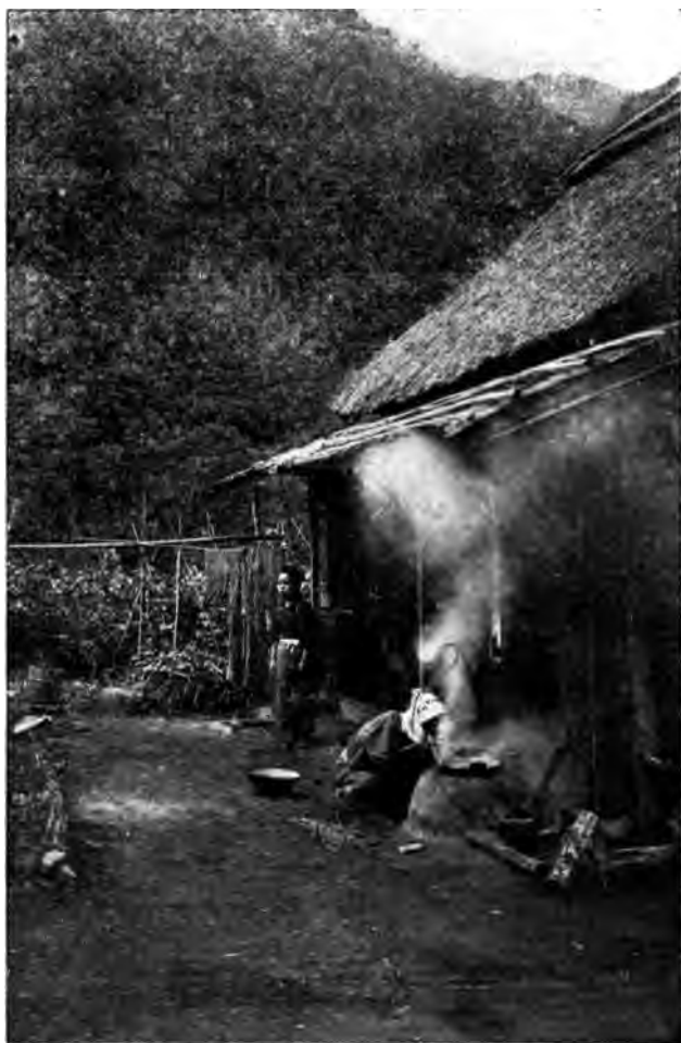
A FARMER'S HOME